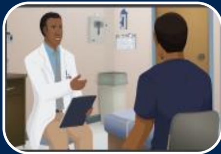
Training & TA for health professionals