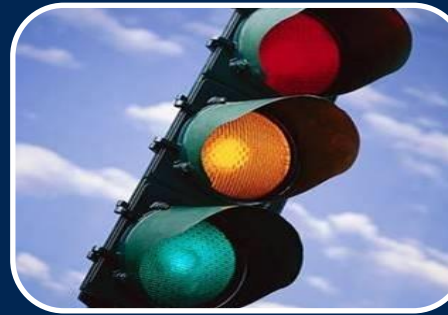
Promote prevention & early intervention